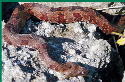
Brown water snake