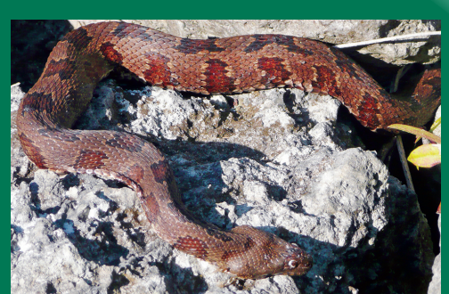
Brown water snake