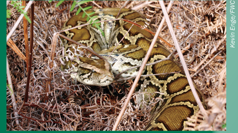
Burmese pythons can hide in overgrown vegetation.

The Burmese python is a large, nonvenomous constrictor snake that has been introduced to Florida. These snakes threaten the Everglades ecosystem, including native wildlife. They can reproduce in great numbers and eat a wide variety of food items ranging from eggs to small deer.